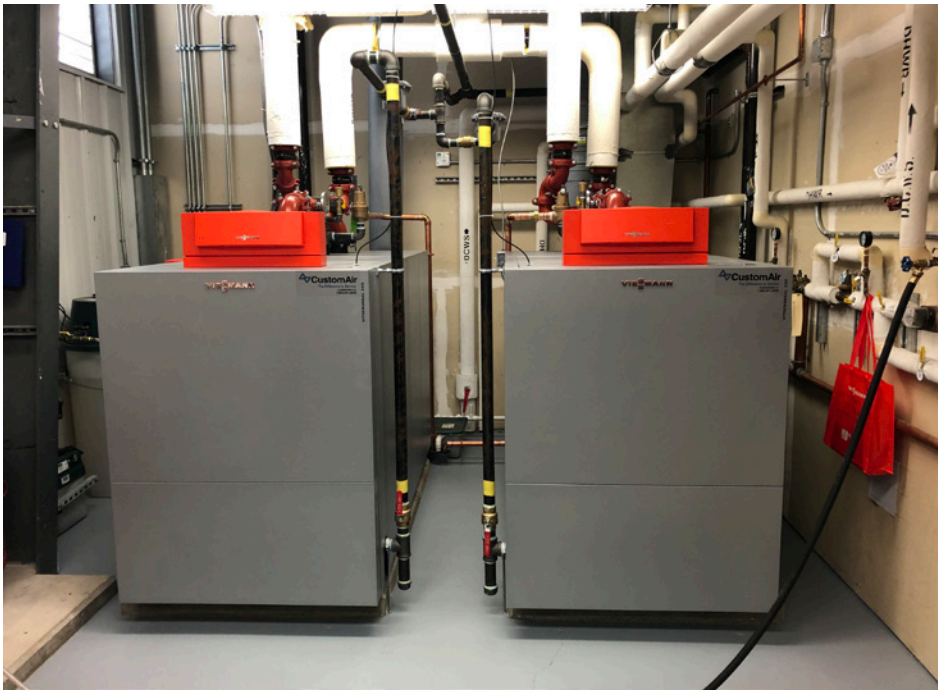
Whistler Transit Centre Boiler System