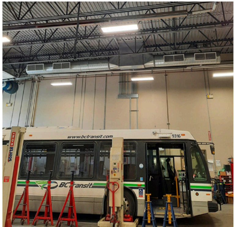
Chilliwack Transit Centre Bay Lighting