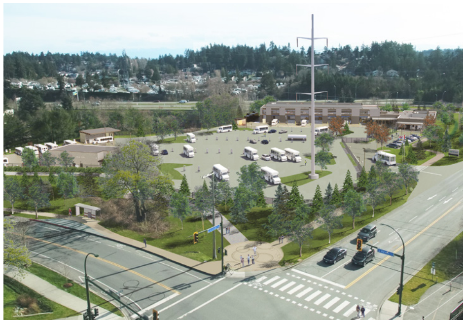
handyDART Facility Rendering

The yard at the new handyDART site is being designed to include charging infrastructure for a fleet of electric buses to be housed at the facility, meaning both the facility and the fleet are being designed to minimize environmental impacts.