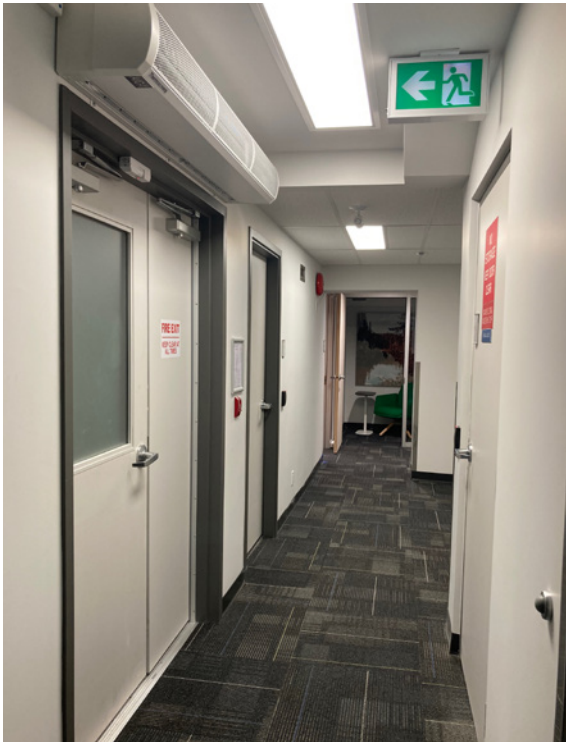
Air Curtains and LED paneling at the Victoria Administration Building

LED lighting and control system upgrade projects were completed at the Chilliwack Transit Centre. These upgrades will improve employee and visitor comfort, reduce carbon emissions from operations as well as decrease the frequency of equipment replacement due to the extended lifespan of LED technologies.