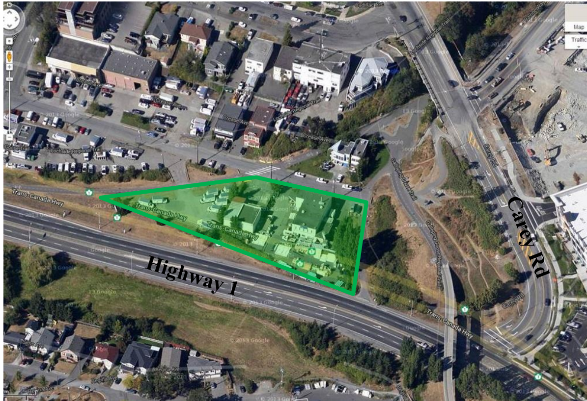
Figure 2: Proposed Uptown Transit Hub Location

The design of these transit hubs has not been completed. The design process will include consultation and partnership between the local governments, the Commission, MoTI, and BC Transit.