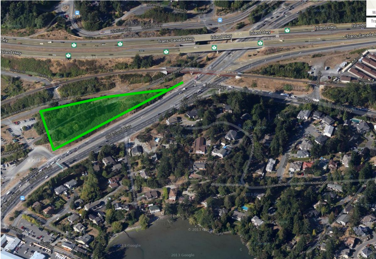
Figure 1: Proposed 6 Mile Park & Ride Location

In 2011, BC Transit, in partnership with the Province, purchased land in the Uptown Area (Figure 2) in anticipation of this transit exchange to ensure that the required footprint could be preserved for the future exchange. The land is being retained as a strategic land holdings and the costs have been covered by the Province until such time they are developed for use as a transit exchange.