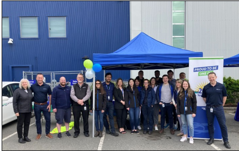
BC Transit Career Fair – May 6, 2023