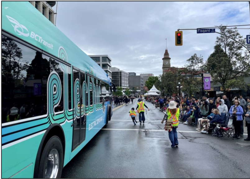
2023 Victoria Day Parade