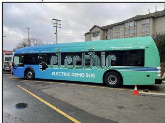
BC Transit Battery Electric Bus