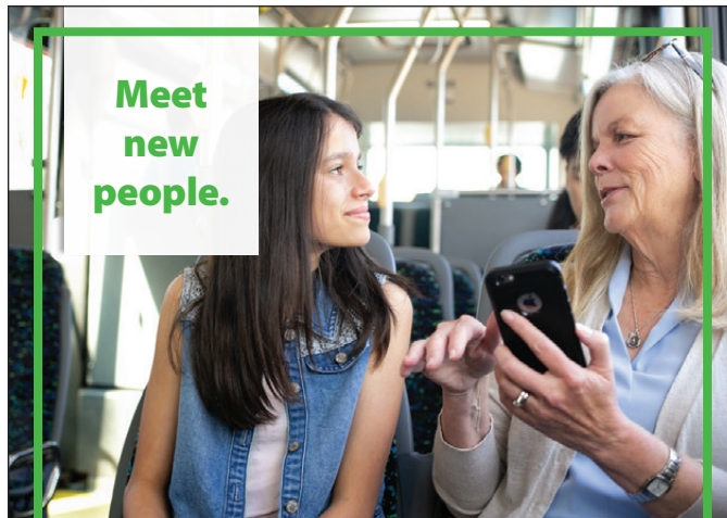
RIDE WITH BCTRANSIT.COM

Health Connections is a transit service providing communities with accessible transportation options to access non-emergency medical appointments. Although medical appointments have priority, everyone is eligible to use this service if space is available. Call 250-837-3888 to book your trip. Visit bctransit.com for Health Connections schedules.