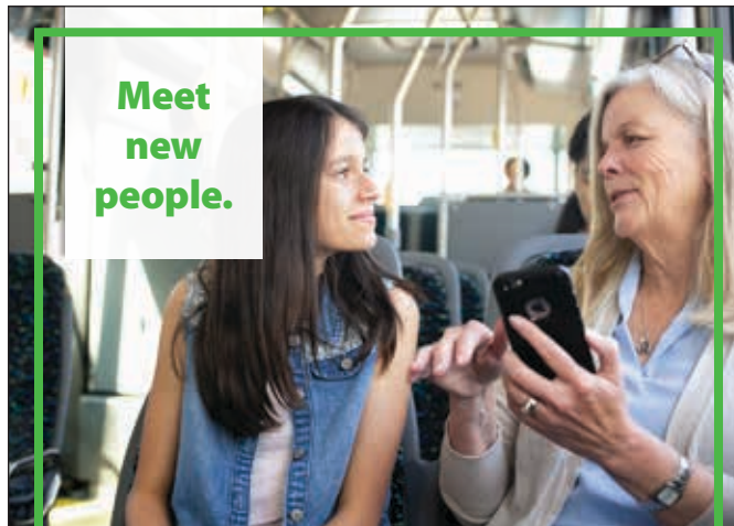
RIDE WITH BCTRANSIT.COM

Health Connections is a transit service providing communities with accessible transportation options to access non-emergency medical appointments. Although medical appointments have priority, everyone is eligible to use this service if space is available. Call 250-837-3888 or 1-866-618-8294 to book your trip. Visit bctransit.com for Health Connections schedules.