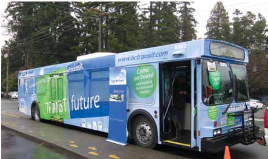
Transit Future Bus

A key element in public consultation in support of Transit Future Plans is the "Transit Future Bus", a 12m bus re-worked as a mobile public consultation tool.