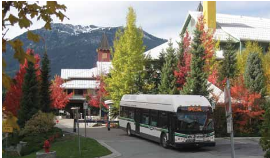
Hydrogen Fuel Cell Bus

In August 2011 BC Transit unveiled two demonstration buses in Victoria on the same day, featuring emission-reducing technology to help contribute to cleaner air. The zero-emission BYD electric eBus-12 and the Alexander Dennis double decker outfitted with a new, emission reducing Cummins engine were in Victoria as part of BC Transit's ongoing commitment to exploring sustainable transit solutions.