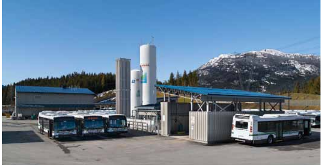
Whistler Transit Facility